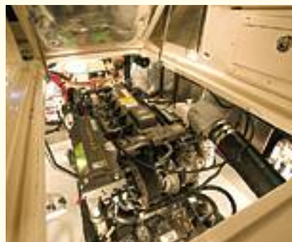
Right: The expansive covered bridge deck provides a large amount of room to cook, eat and socialize, and perhaps just as important, the engine room is well-laid out and provides room enough to work while performing maintenance. Optional colored hull is shown.