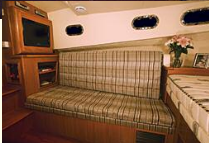
Right Center: The salon features a standard 19" flat panel TV, and a well-thought-out settee that converts to a pullman over and under sleeper.