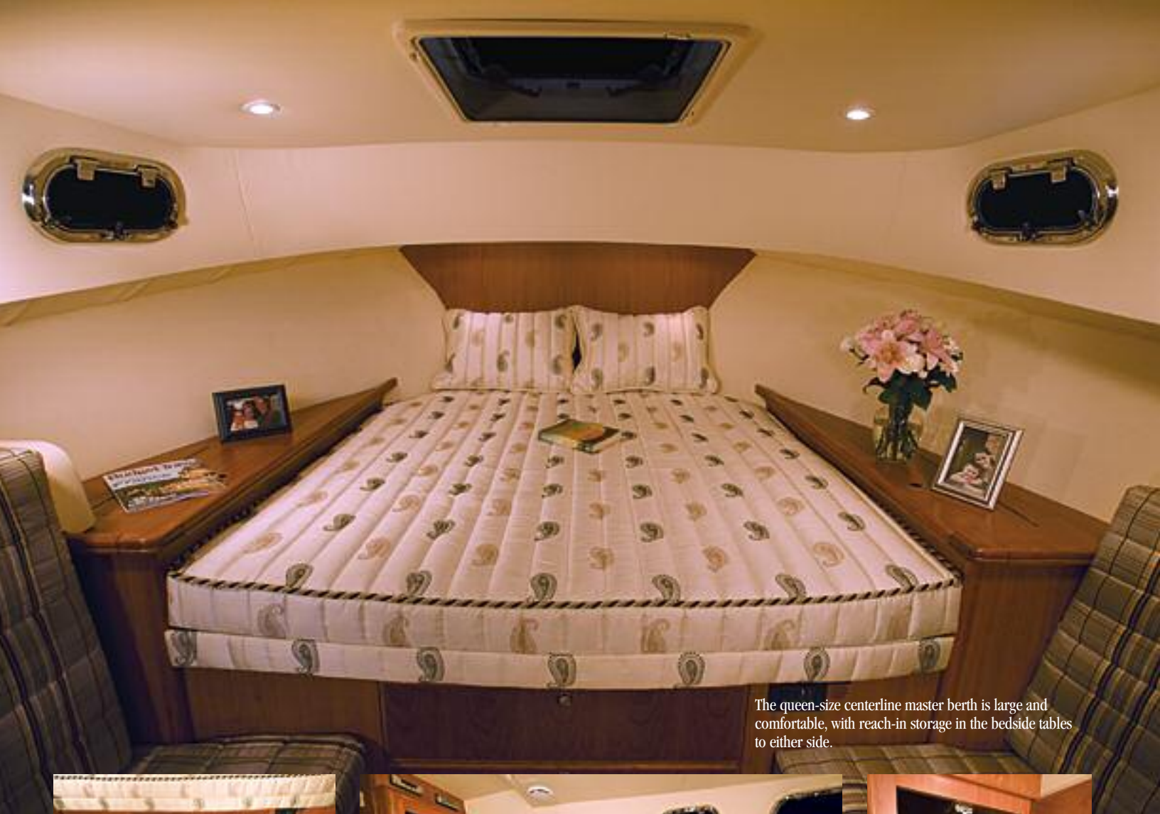
The queen-size centerline master berth is large and comfortable, with reach-in storage in the bedside tables to either side.