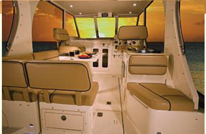
Top: The Pilot 31 Sedan features a unique Cockpit Galley that includes a Corian® countertop, a two-burner electric stove, microwave oven, refrigerator/freezer, stainless steel sink with designer faucet, and plenty of under-counter storage.