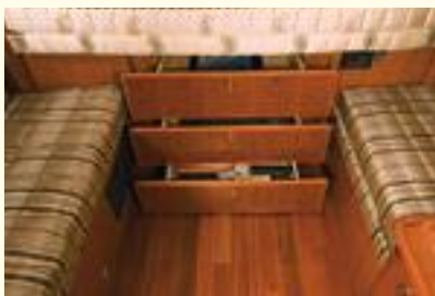
Above: Centerline drawers under the queen-size centerline berth provide plenty of storage.